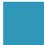
PANTONE 549 (Blue)

The approved colors of the logo components are listed at right. CMYK refers to the four-color process percentages of cyan, magenta, yellow and black. The CMYK colors may be used only when PMS 549 cannot be used.